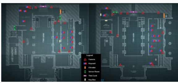
Payday 2 election day solo stealth guide.