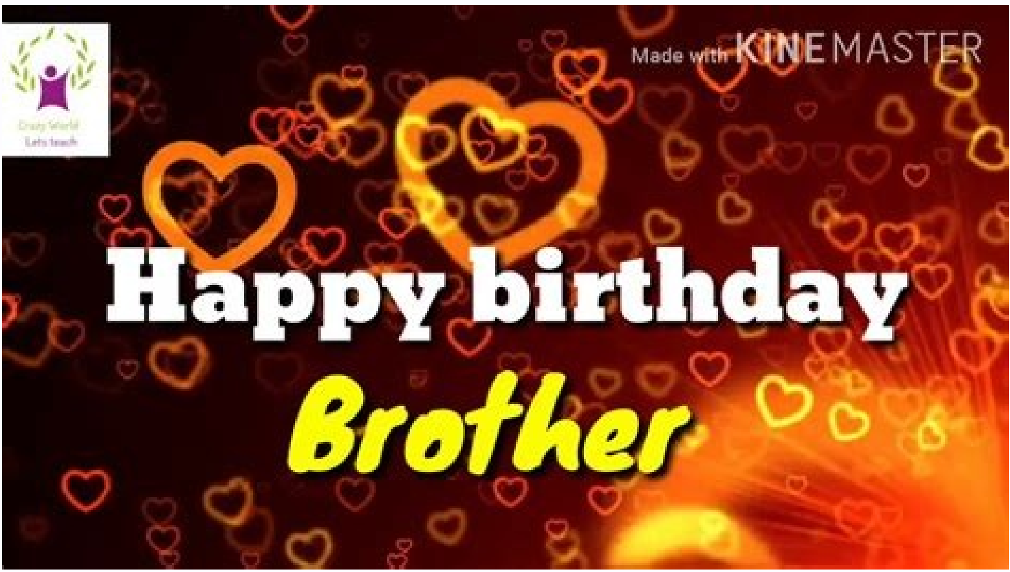
Happy birthday song whatsapp status audio download. Happy birthday audio song for whatsapp status.