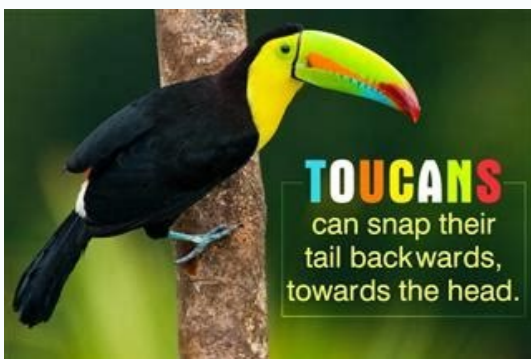
TOUCANS can snap their tail backwards, towards the head.

Why do toucans live in the rainforest. Toucan adaptations in the tropical rainforest. What do toucans do in the rainforest. What helps a toucan survive in the rainforest.