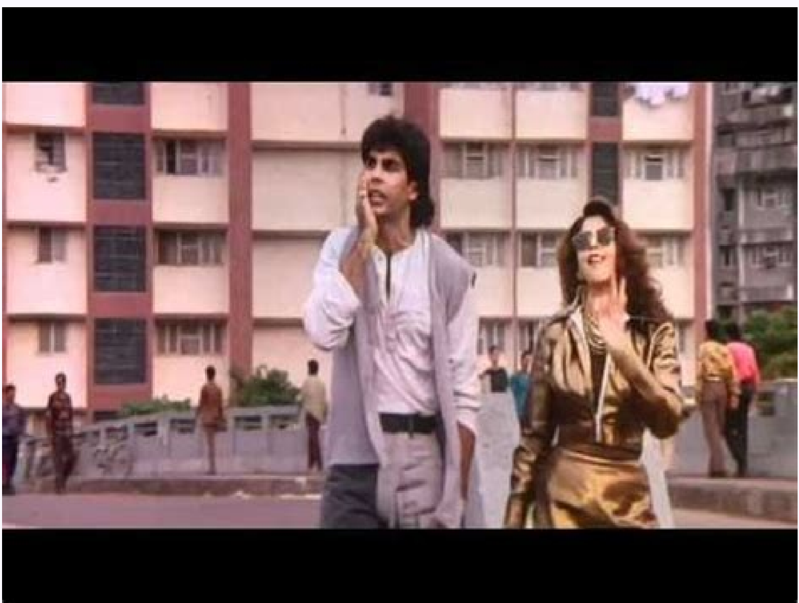
Gore gore mukhde pe mp3 song free download.